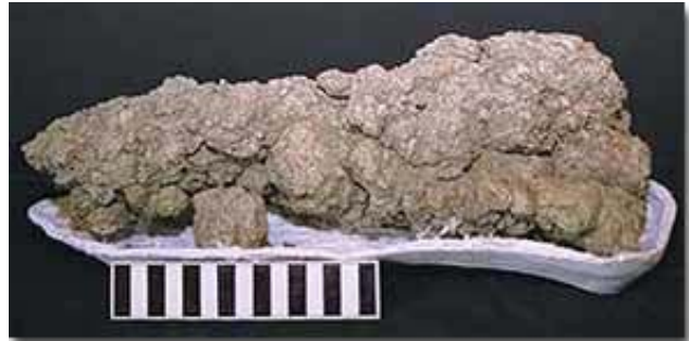
T. rexcrement. This 2.4 liter object was deposited 65-million years ago in Saskatchewan. From the crunched-up dino bones it contained, scientists figure it's the daily business of a Tyrannosaurus rex.

Carnivore dung is also chemically conducive to fossilization, Chin adds. Bones contain calcium, which can combine to form calcium phosphate, the major chemical that,