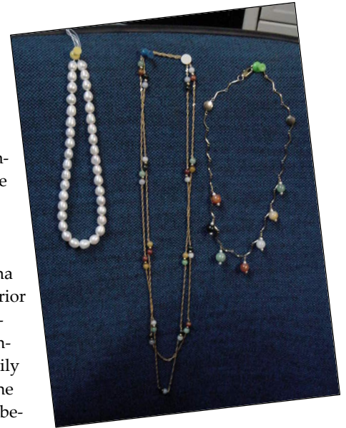
Necklaces created by the participants on the cruise included jade and natural pearl.

The Margaritas in Ensenada were pretty good too!