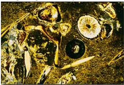
A thin slice of coprolite shows fish teeth and fish vertebrae. Guess what this animal ate?

When sliced into thin sections and examined under a microscope, coprolites may contain seeds, leaves, wood, mollusks,