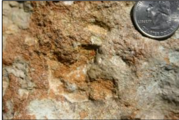
The small, three-toed track is a baby stegosaurus hindpaw. Above the center toe of the hind-track is the impression of the thumb.

Abundant in natural history, the tiny foothills town of Morrison has yielded important fossils since 1877. Morrison Natural History Museum researchers began exploring the 150-million-